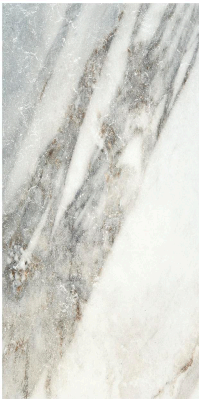
GREY 12" x 24" Code # GE.CE.GRY.1224

This is for your handy reference. Colours and styles shown here are meant only to give you a preliminary indication pending the development of sampling, which will be rushed to you as soon as possible.