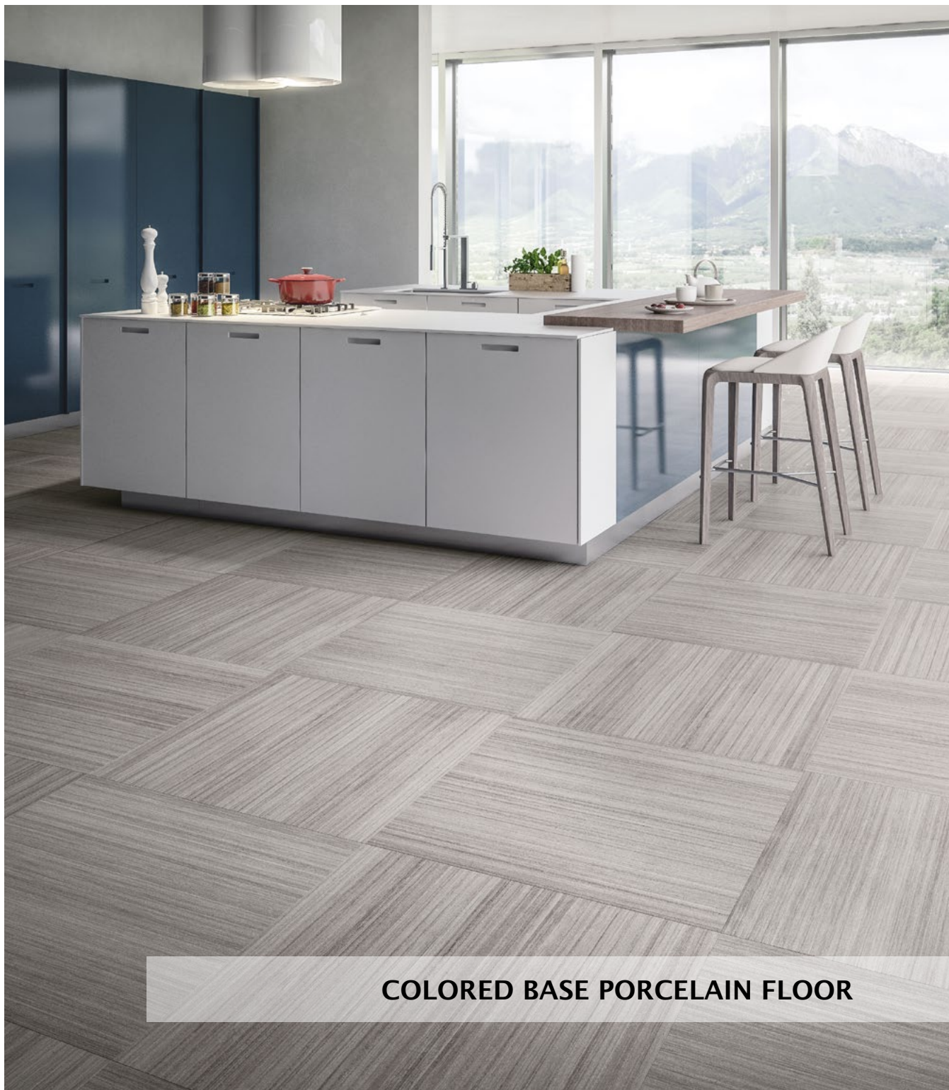
COLORED BASE PORCELAIN FLOOR

This collection is inspired by the Zebrano stone: a traditional matrix translated with contemporary appeal, providing versatile surfaces suited for use in all modern environments, thanks to a wide range of sizes and finishes.